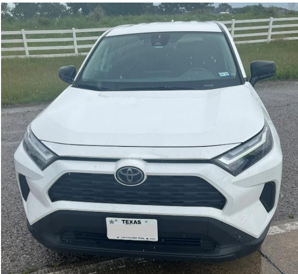
Asset #29471 (Terrell Station)