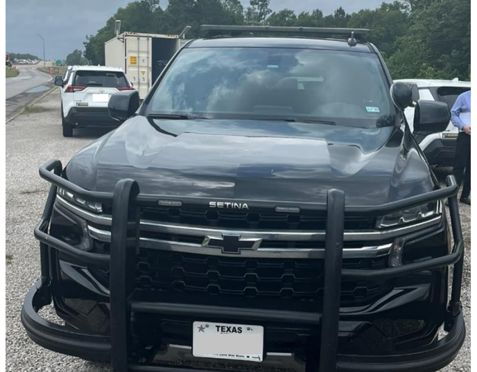
Asset #29442 (Orange Station)