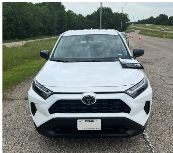
Asset #29470 (Mount Pleasant Station)