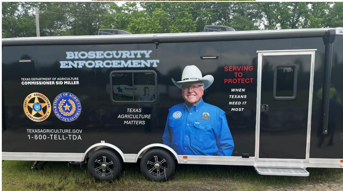
Asset #29445 (Mount Pleasant Station)