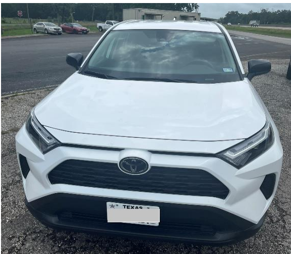
Asset #29463 (Orange Station)