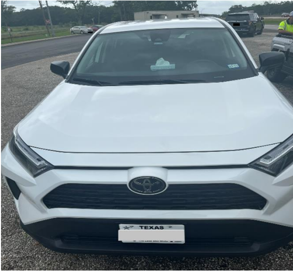
Asset #29466 (Orange Station)