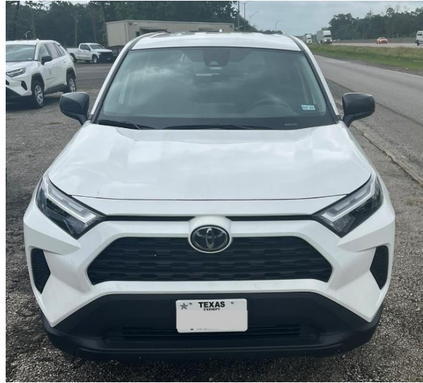
Asset #29467 (Orange Station)