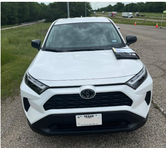
Asset #29465 (Mount Pleasant Station)