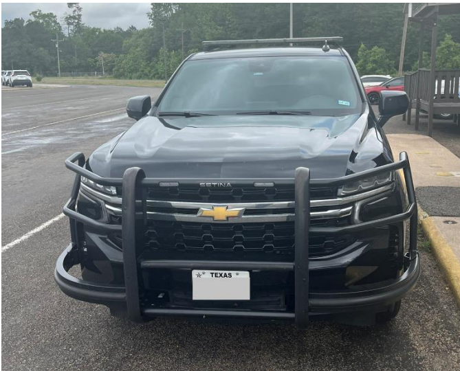
Asset #29443 (Orange Station)