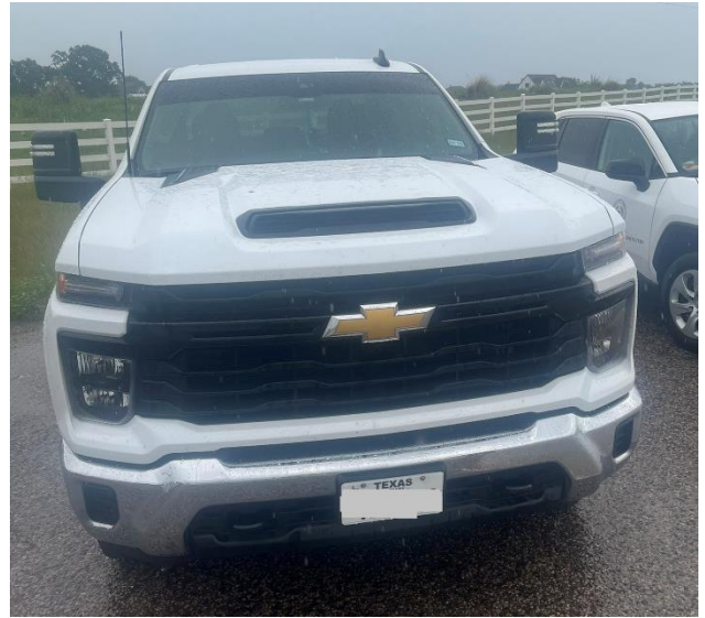
Asset #29430 (Terrell Station)