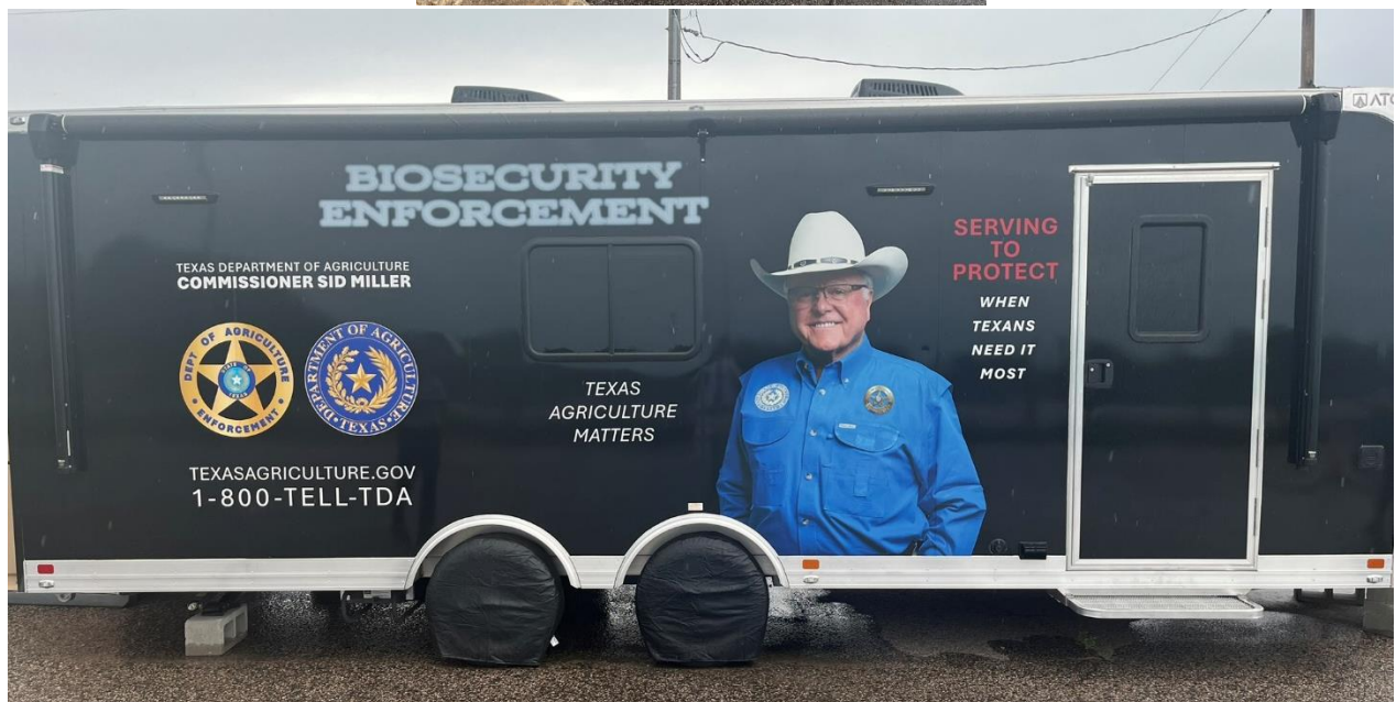
Asset #29444 (Terrell Station)