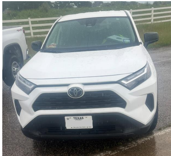
Asset #29469 (Terrell Station)