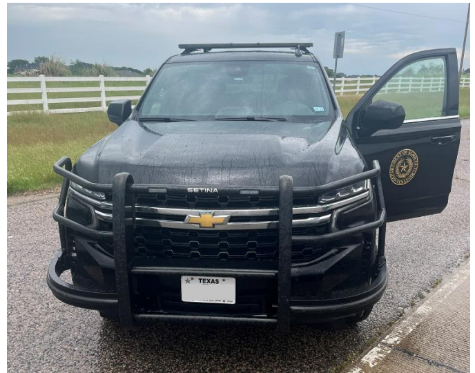
Asset #29440 (Terrell Station)