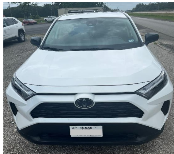
Asset #29464 (Orange Station)