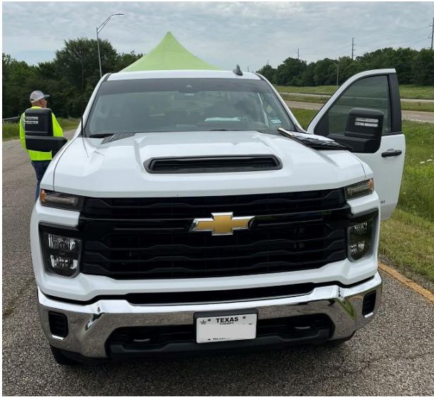
Asset #29431 (Mount Pleasant Station)