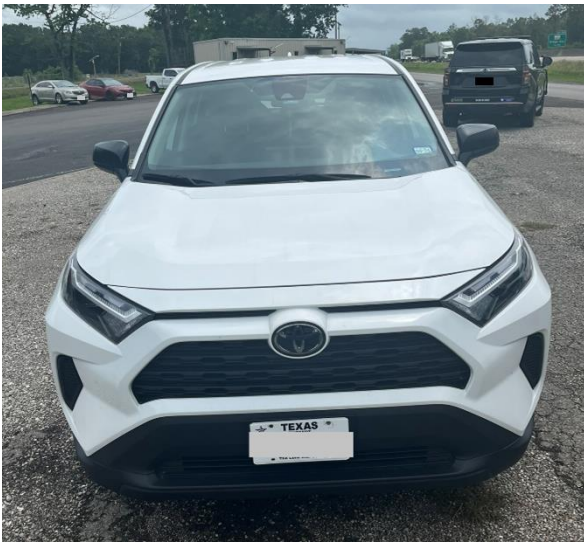
Asset #29468 (Orange Station)