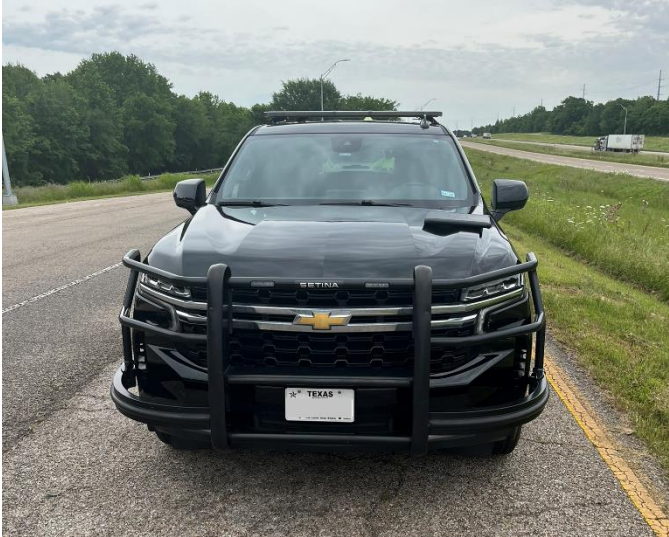
Asset #29441 (Mount Pleasant Station)